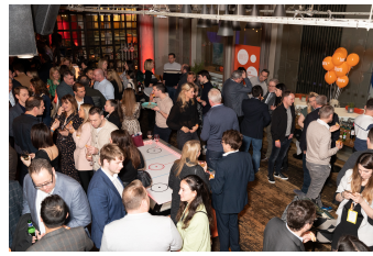
Gifties get together at The Refinery Bankside

Join us on March 6 for the First-Night Party, open to ALL conference delegates.